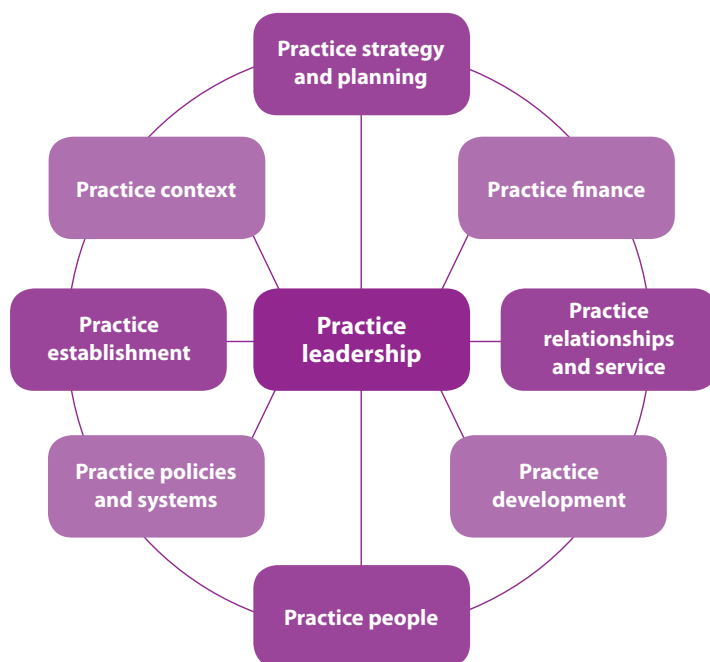
Figure 1: Practice Management Guidelines Model

The 2010 model is illustrated in Figure 1.